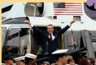
Richard Nixon was President

Dow Jones Industrial Average - 616 Average cost of new house - $34,900 Average income per year - $13,900 Average monthly rent - $185 Cost of a gallon of gas - 42 cents Buick station wagon - $4,371 Dozen eggs - 45 cents