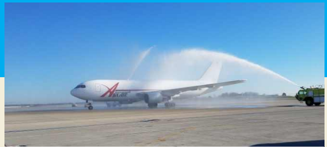
Traditional water cannon salute for retiring pilots.